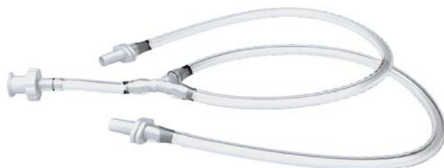
G-38633 Y SILICONE TUBE to connect to DMEK irrigation handpieces G-38631 and G-38632