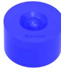
G-32672 SILICONE BLOCK for graft cornea

The last step involves punching out the desired size. The graft should then be stored in liquid so that its fragile structure is not stressed.