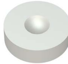
G-38620 SZURMAN DMEK GRAFT RETAINER for preparation of DMEK graft

In order to prepare the donor cornea, the eye must be fixated securely.