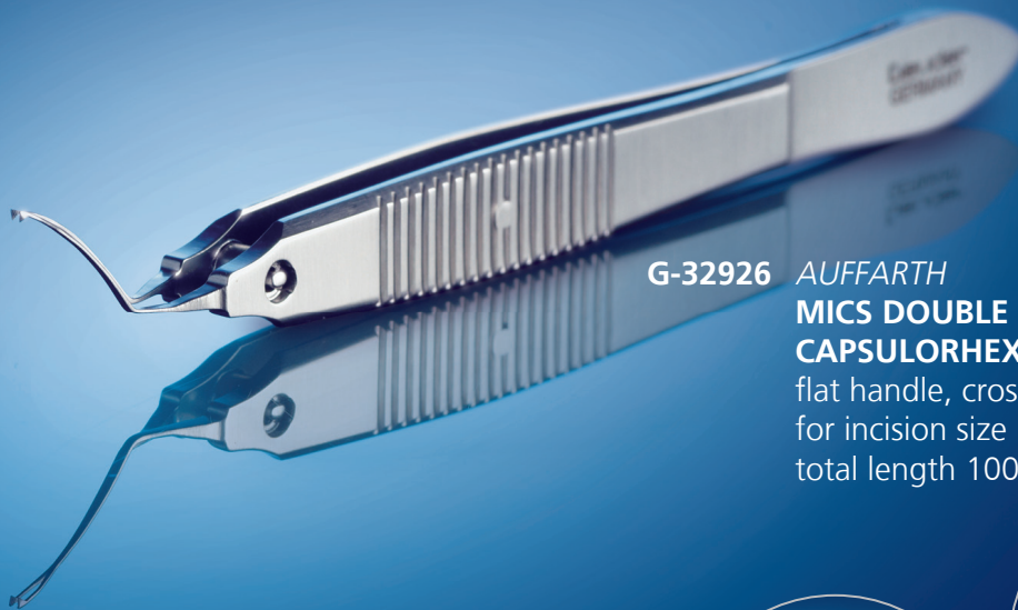
G-32926 AUFFARTH MICS DOUBLE CROSS ACTION CAPSULORHEXIS FORCEPS flat handle, cross-action, for incision size 1.6 mm, total length 100 mm

AUFFARTH MICS DOUBLE CROSS ACTION CAPSULORHEXIS FORCEPS